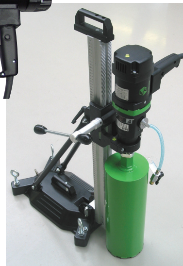
END 130/3.1 POSV

All models include a built-in leveling bubble, safety slip clutch, water swivel, overload signal and GFCI to prevent electric shock for operator safety. Connecting threads of 5/8" x 11 UNC, 1-1/4" x 7 UNC and G1/2" fit all standard core bits.